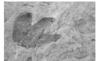
Dinosaur tracks at Dinosaur Ridge.

Participants of the meeting were invited to attend a field trip which included an overview of the geology of the Colorado Front Range with emphasis on the Cretaceous outcrops along the Dinosaur Ridge Hogback and the Pennsylvanian Fountain Formation at Red Rock Park. Dinosaur Ridge was the site of the first discovery of several Jurassic dinosaur species including Apatosaurus, Diplodocus, Stegosaurus and Allosaurus. Red Rock Park is a natural amphitheater composed of 300-million-year-old rocks of the Pennsylvanian Fountain Formation. It has served as the venue for many famous entertainers over the years such as The Beatles, John Denver, Fleetwood Mac, The Grateful Dead and U2.