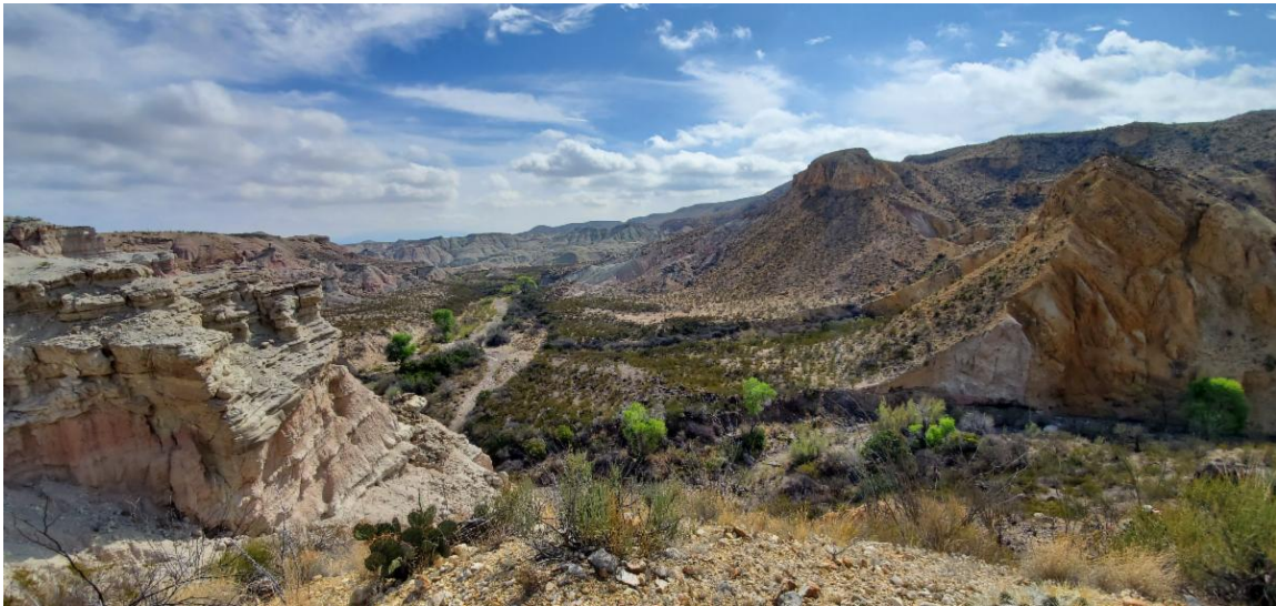
Big Bend National Park in Texas

The Board unanimously adopted this amendment.