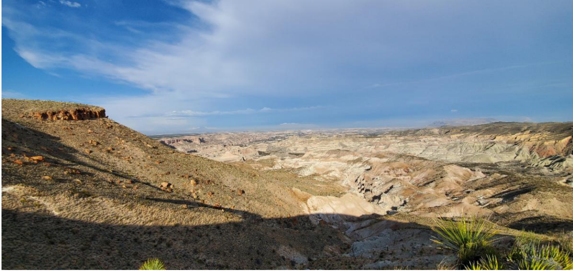
Big Bend National Park in Texas

Together, let's sculpt the future of Geoscience in Texas.